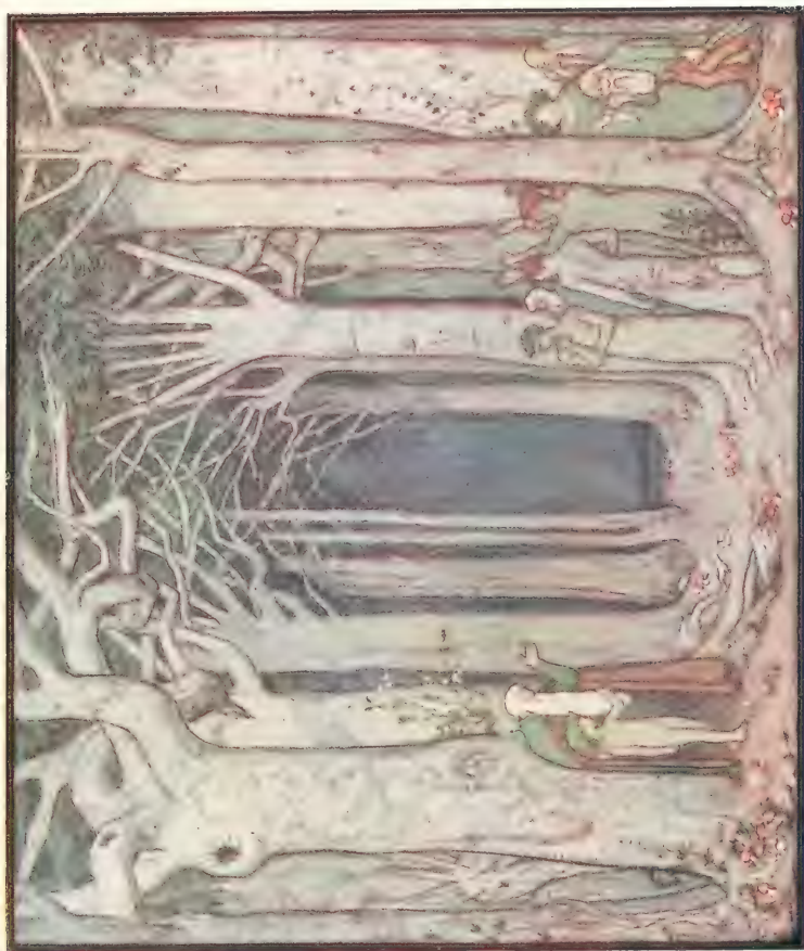
THE CAVE OF THE WISE MEN OF THE EAST